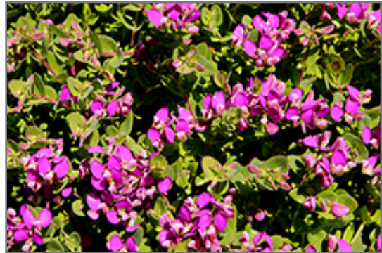
More Mesa Grande Sweet Pea Shrub flowers

More Mesa Grande Sweet Pea Shrub is recommended for the following landscape applications;