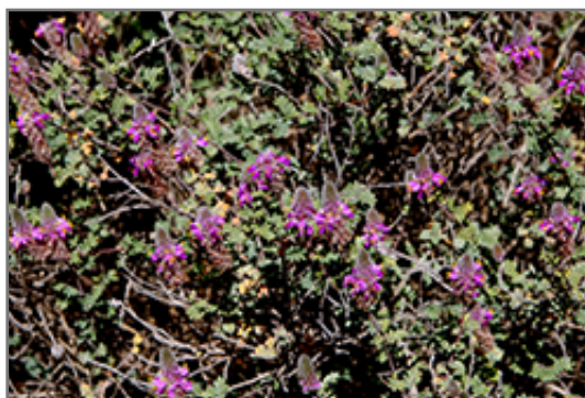
Sonoran False Prairie-clover flowers

Sonoran False Prairie-clover is recommended for the following landscape applications;