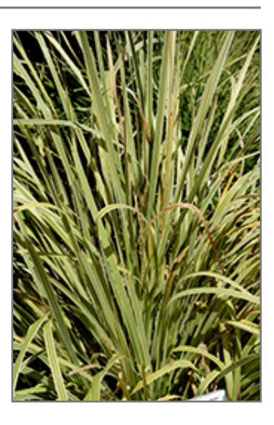
Lucky Stripe Mat Rush foliage