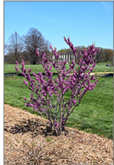
Celestial Plum Redbud in bloom