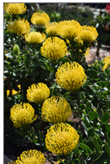
High Gold Pincushion flowers

High Gold Pincushion is recommended for the following landscape applications;