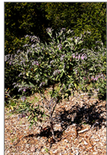
El Tigre Fragrant Pitcher Sage in bloom