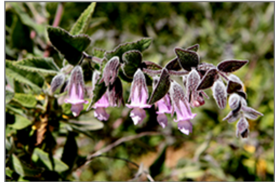
El Tigre Fragrant Pitcher Sage flowers

El Tigre Fragrant Pitcher Sage is recommended for the following landscape applications;