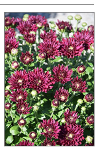
Lagoon Purple Chrysanthemum flowers