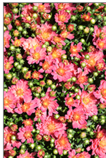
Jacqueline Peach Fusion Chrysanthemum flowers

Jacqueline Peach Fusion Chrysanthemum is recommended for the following landscape applications;