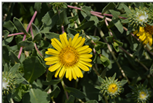
Ray's Carpet Coastal Gum Plant flowers

Ray's Carpet Coastal Gum Plant is recommended for the following landscape applications;