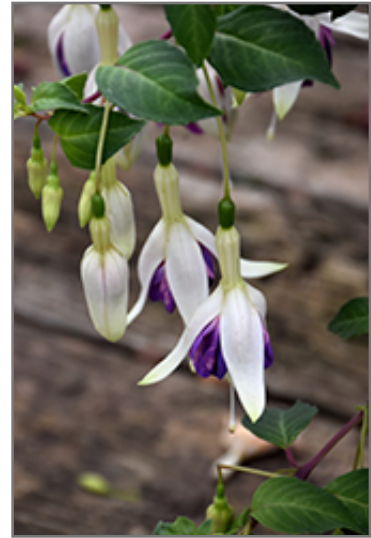
Delta's Sarah Fuchsia flowers