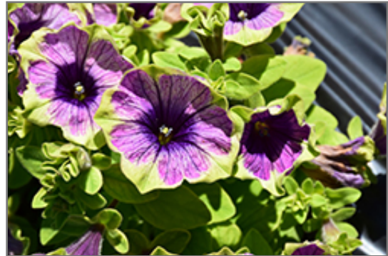
Surprise Green Tambourine Petunia flowers

Surprise Green Tambourine Petunia is recommended for the following landscape applications;