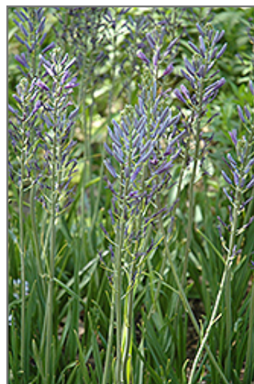
Blue Camassia flowers