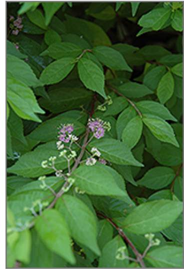
Japanese Beautyberry flowers

This plant is not reliably hardy in our region, and certain restrictions may apply; contact the store for more information.