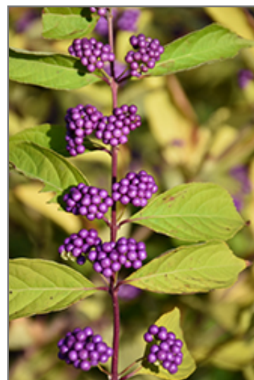
Japanese Beautyberry fruit