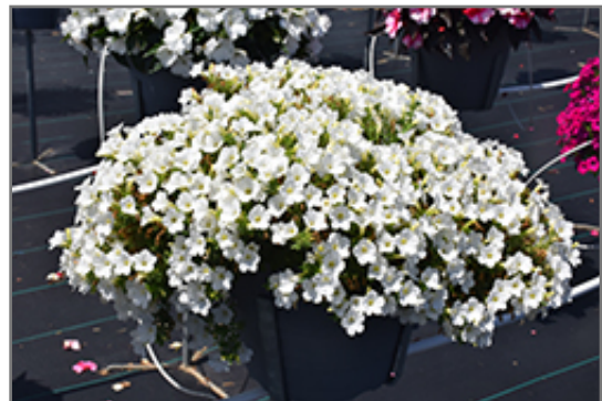
Itsy White Petunia in bloom