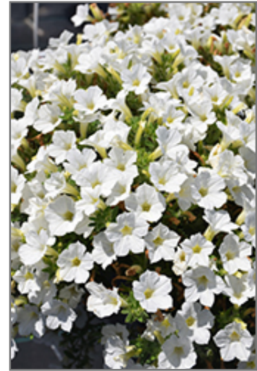
Itsy White Petunia flowers

Itsy White Petunia is recommended for the following landscape applications;