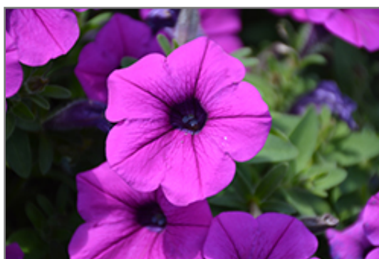
Durabloom Electric Lilac Petunia flowers