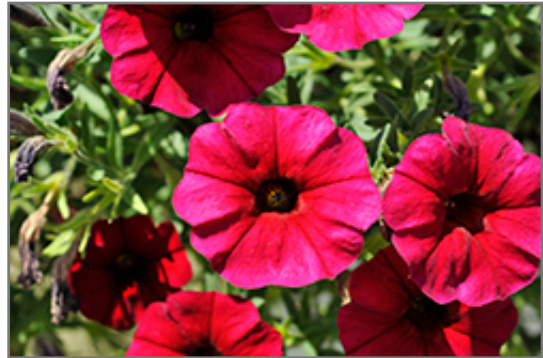
SuperCal Royal Red Petchoa flowers

SuperCal Royal Red Petchoa will grow to be about 12 inches tall at maturity, with a spread of 18 inches. When grown in masses or used as a bedding plant, individual plants should be spaced approximately 15 inches apart. Its foliage tends to remain dense right to the ground, not requiring facer plants in front. This fast-growing annual will normally live for one full growing season, needing replacement the following year.