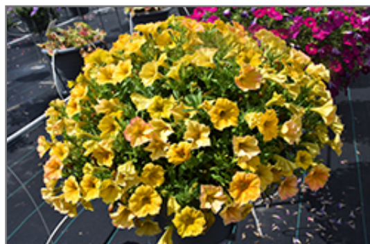
SuperCal Premium Yellow Sun Petchoa in bloom