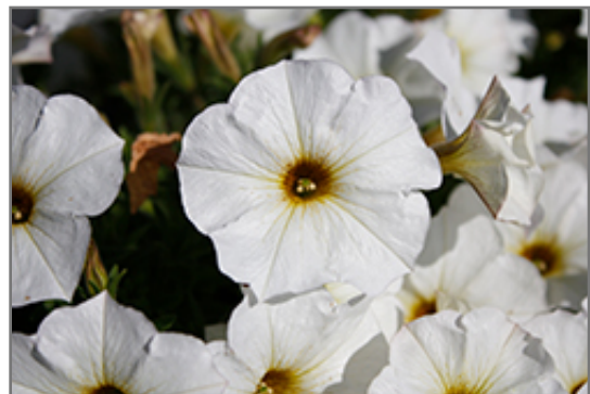
SuperCal Premium Pearl White Petchoa flowers