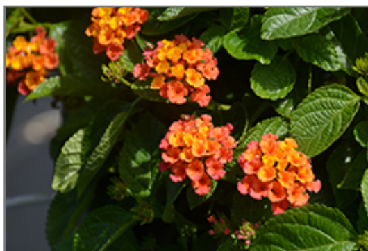
Havana Harvest Moon 2022 Lantana flowers