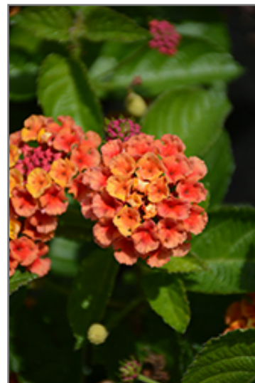
Havana Harvest Moon 2022 Lantana flowers

Havana Harvest Moon 2022 Lantana is recommended for the following landscape applications;