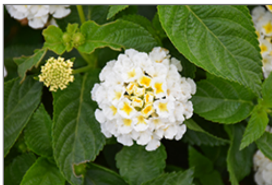
Havana Full Moon Lantana flowers

Havana Full Moon Lantana is recommended for the following landscape applications;