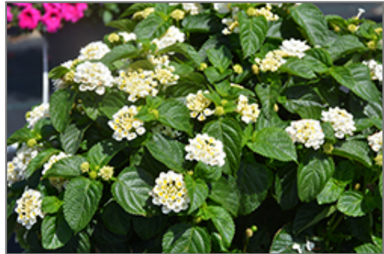
Havana Full Moon Lantana flowers

Havana Full Moon Lantana will grow to be about 18 inches tall at maturity, with a spread of 18 inches. When grown in masses or used as a bedding plant, individual plants should be spaced approximately 14 inches apart. Although it's not a true annual, this fast-growing plant can be expected to behave as an annual in our climate if left outdoors over the winter, usually needing replacement the following year. As such, gardeners should take into consideration that it will perform differently than it would in its native habitat.