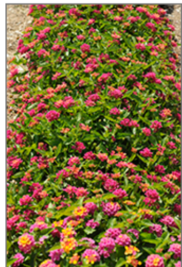
Havana Cherry Lantana in bloom