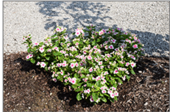
Soiree Flamenco Senorita Pink Vinca in bloom

Soiree Flamenco Senorita Pink Vinca will grow to be about 12 inches tall at maturity, with a spread of 16 inches. Its foliage tends to remain dense right to the ground, not requiring facer plants in front. Although it's not a true annual, this fast-growing plant can be expected to behave as an annual in our climate if left outdoors over the winter, usually needing replacement the following year. As such, gardeners should take into consideration that it will perform differently than it would in its native habitat.