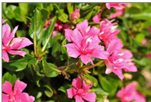
Soiree Double Pink Sky Vinca flowers

Soiree Double Pink Sky Vinca is recommended for the following landscape applications;