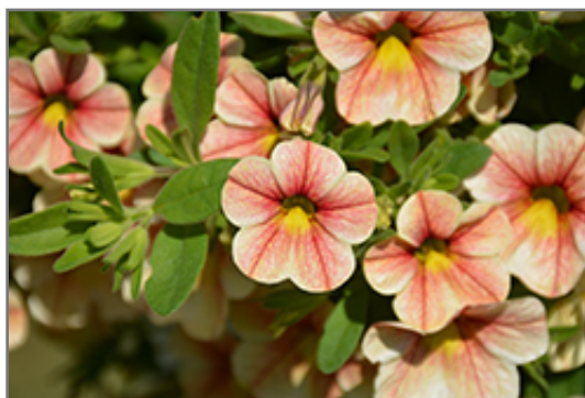
Volcano Sunrise Calibrachoa flowers

Volcano Sunrise Calibrachoa is recommended for the following landscape applications;