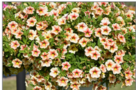
Volcano Sunrise Calibrachoa flowers