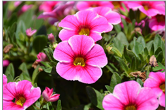
Volcano Pink Calibrachoa flowers

Volcano Pink Calibrachoa is recommended for the following landscape applications;