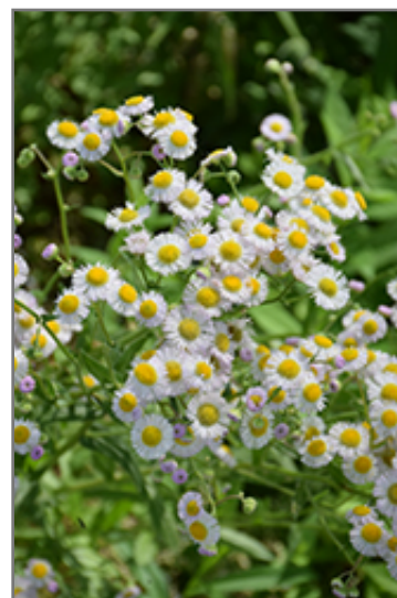
Philidelphia Fleabane flowers

Philidelphia Fleabane is recommended for the following landscape applications;