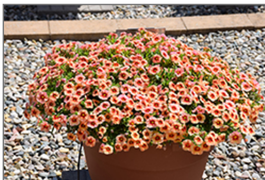
Unique Mango Punch Calibrachoa in bloom