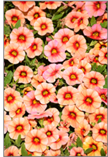
Unique Mango Punch Calibrachoa flowers

Unique Mango Punch Calibrachoa is a fine choice for the garden, but it is also a good selection for planting in outdoor containers and hanging baskets. It is often used as a 'filler' in the 'spiller-thriller-filler' container combination, providing a mass of flowers against which the thriller plants stand out. Note that when growing plants in outdoor containers and baskets, they may require more frequent waterings than they would in the yard or garden.