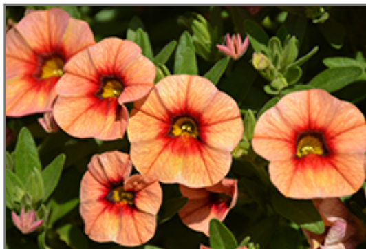
Unique Mango Punch Calibrachoa flowers

This plant will require occasional maintenance and upkeep. Trim off the flower heads after they fade and die to encourage more blooms late into the season. It is a good choice for attracting bees, butterflies and hummingbirds to your yard, but is not particularly attractive to deer who tend to leave it alone in favor of tastier treats. It has no significant negative characteristics.