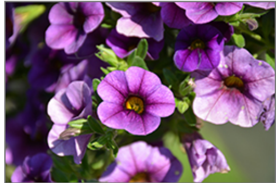
Unique Lilac Calibrachoa flowers

This plant will require occasional maintenance and upkeep. Trim off the flower heads after they fade and die to encourage more blooms late into the season. It is a good choice for attracting bees, butterflies and hummingbirds to your yard, but is not particularly attractive to deer who tend to leave it alone in favor of tastier treats. It has no significant negative characteristics.