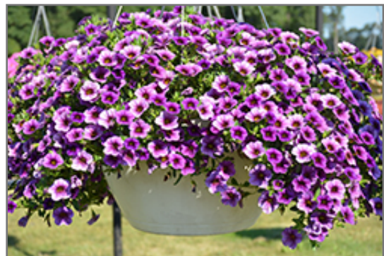
Unique Lilac Calibrachoa in bloom