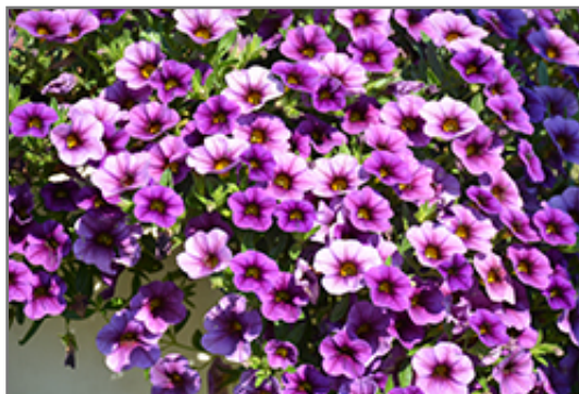
Unique Lilac Calibrachoa flowers

Unique Lilac Calibrachoa will grow to be about 12 inches tall at maturity, with a spread of 14 inches. When grown in masses or used as a bedding plant, individual plants should be spaced approximately 10 inches apart. Its foliage tends to remain dense right to the ground, not requiring facer plants in front. This fast-growing annual will normally live for one full growing season, needing replacement the following year.