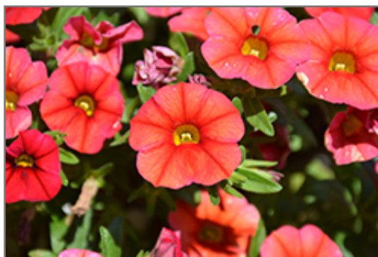
Unique Light Red Calibrachoa flowers