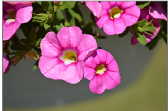
Unique Hot Pink Calibrachoa flowers

Unique Hot Pink Calibrachoa is recommended for the following landscape applications;