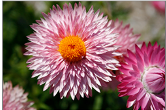
Granvia Pink Strawflower flowers