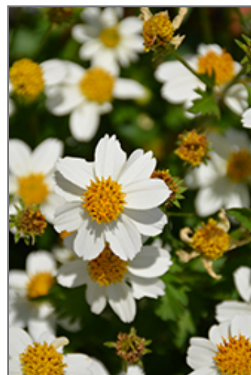
White Delight Bidens flowers

White Delight Bidens is recommended for the following landscape applications;