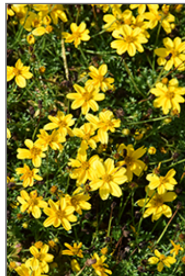
Bidy Gonzales Big Bidens flowers