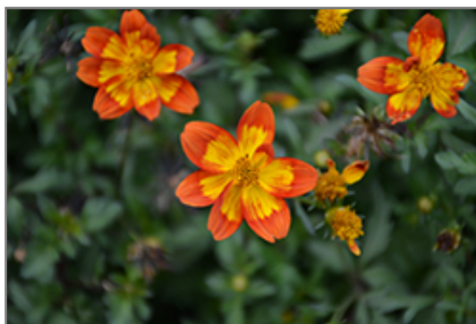
Bidy Boom Wildfire Bidens flowers