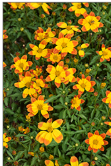
Bidy Boom Red Bidens flowers