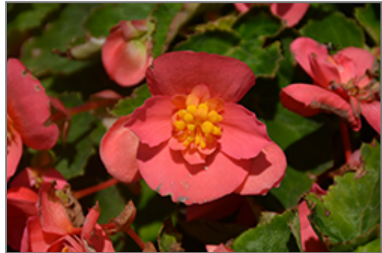
RiseUp Bull's Eye Begonia flowers

RiseUp Bull's Eye Begonia is recommended for the following landscape applications;