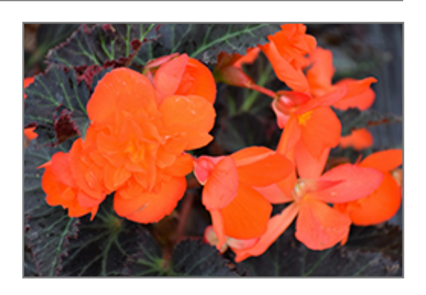
l'Conia Portofino Orange Begonia flowers