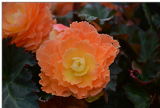
I'Conia Miss Miami Begonia flowers

I'Conia Miss Miami Begonia is recommended for the following landscape applications;