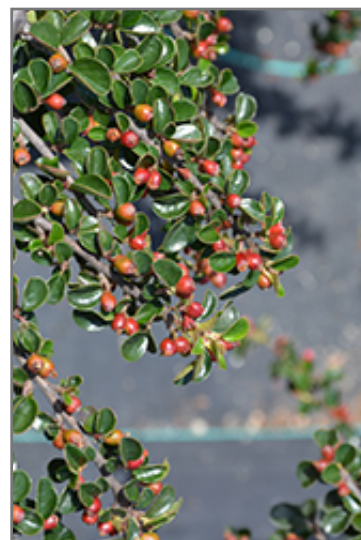
Ladder Leaf Cotoneaster fruit

Ladder Leaf Cotoneaster is recommended for the following landscape applications;