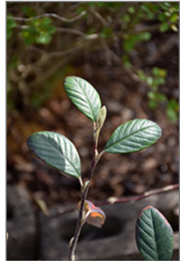
Parney's Cotoneaster foliage