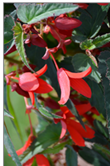
Mistral Red Begonia flowers

Mistral Red Begonia is recommended for the following landscape applications;