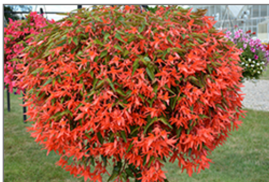
Beauvilia Dark Salmon Begonia in bloom