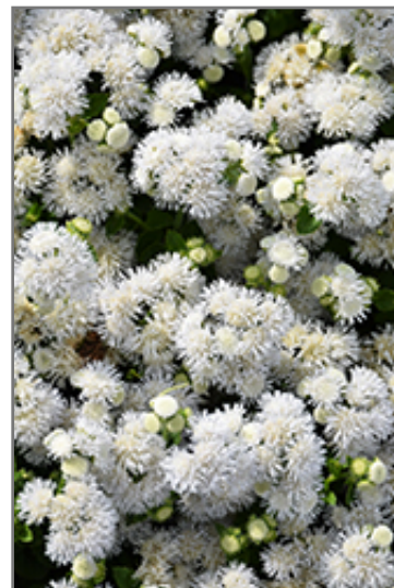
Bumble White Flossflower flowers

This is a relatively low maintenance plant, and should not require much pruning, except when necessary, such as to remove dieback. It is a good choice for attracting bees, butterflies and hummingbirds to your yard, but is not particularly attractive to deer who tend to leave it alone in favor of tastier treats. It has no significant negative characteristics.