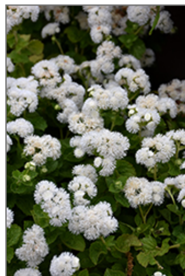
Bumble White Flossflower flowers