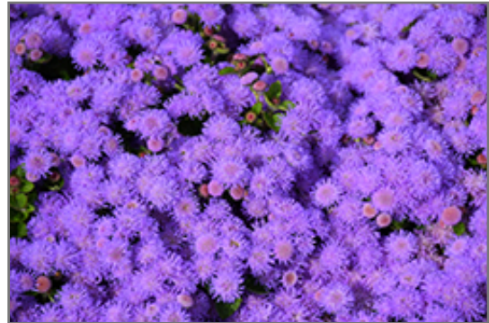
Bumble Blue Flossflower flowers

Bumble Blue Flossflower is recommended for the following landscape applications;