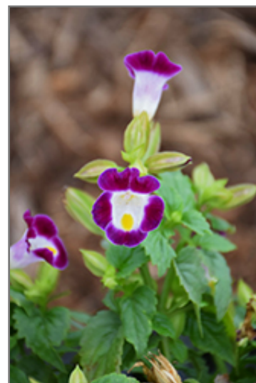
Kauai Burgundy Torenia flowers

Kauai Burgundy Torenia is recommended for the following landscape applications;