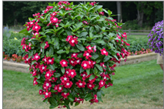
Mediterranean XP Burgundy Halo Vinca in bloom

Mediterranean XP Burgundy Halo Vinca is a fine choice for the garden, but it is also a good selection for planting in outdoor containers and hanging baskets. Because of its trailing habit of growth, it is ideally suited for use as a 'spiller' in the 'spiller-thriller-filler' container combination; plant it near the edges where it can spill gracefully over the pot. Note that when growing plants in outdoor containers and baskets, they may require more frequent waterings than they would in the yard or garden.