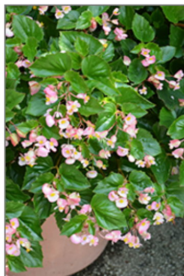
Cocktail Rum Begonia flowers