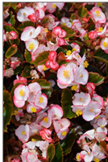
Cocktail Rum Begonia flowers

Cocktail Rum Begonia is recommended for the following landscape applications;