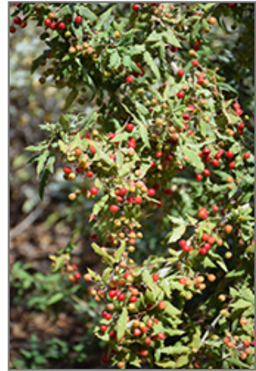
Nevin Barberry fruit

This plant is not reliably hardy in our region, and certain restrictions may apply; contact the store for more information.