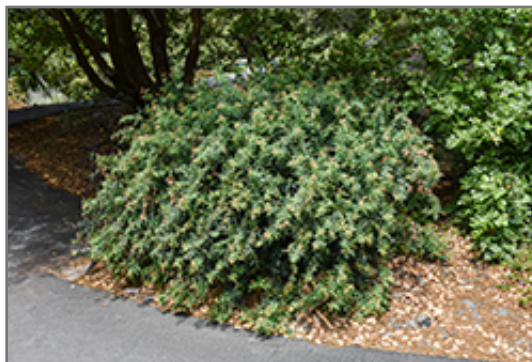
Nevin Barberry