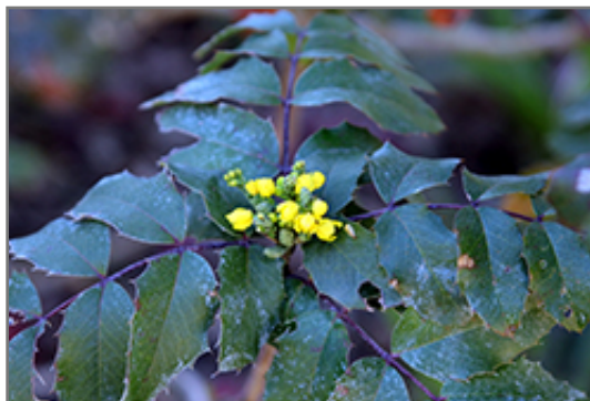
Mission Canyon Barberry flowers