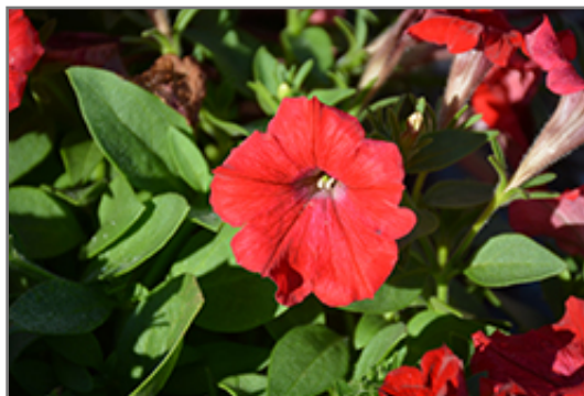
Whispers Red Petunia flowers

Whispers Red Petunia is recommended for the following landscape applications;